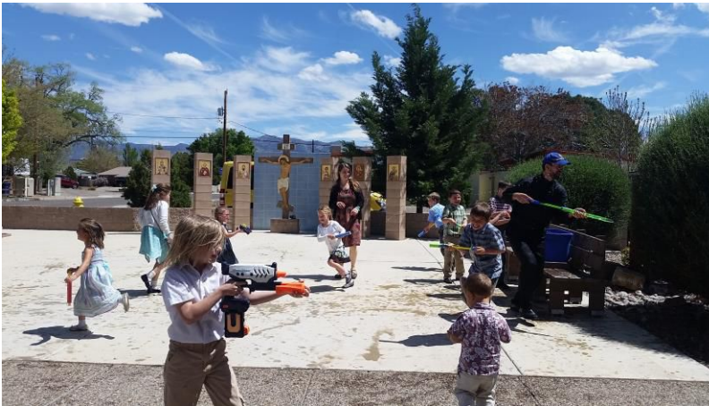
Water gun fight: all were happy and wet