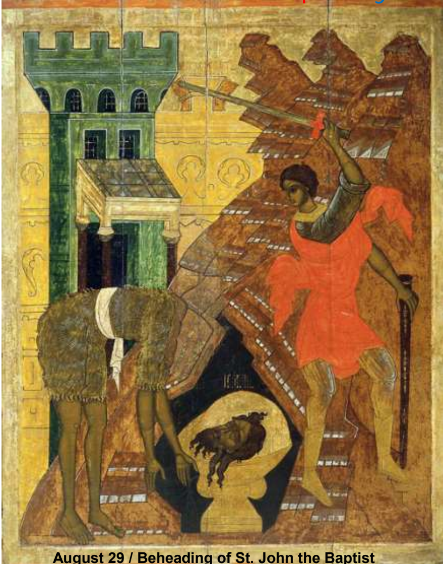
August 29 / Beheading of St. John the Baptist

Christ is Among Us! He is and Always Shall I Be! ¡Cristo está entre nosotros! ¡Está y estará!