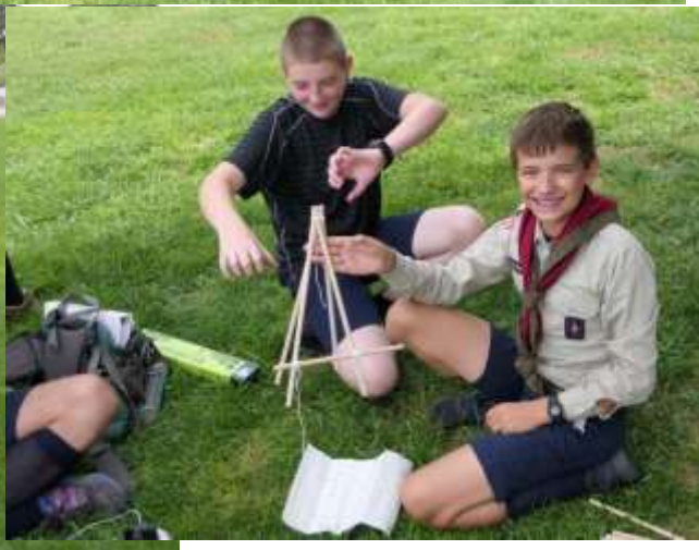
Day of Recollection for Timber Wolf boys of Sangre de Cristo Explorer Youth Group